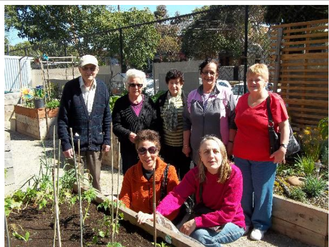
Members of our Gardening Get-Together group with participants of Park Towers Community Garden

Recently we went on a short trip to the community garden at Park Towers in South Melbourne. This is a fascinating and beautiful community garden, that is really developing and everyone at Park Towers should be very proud of it!